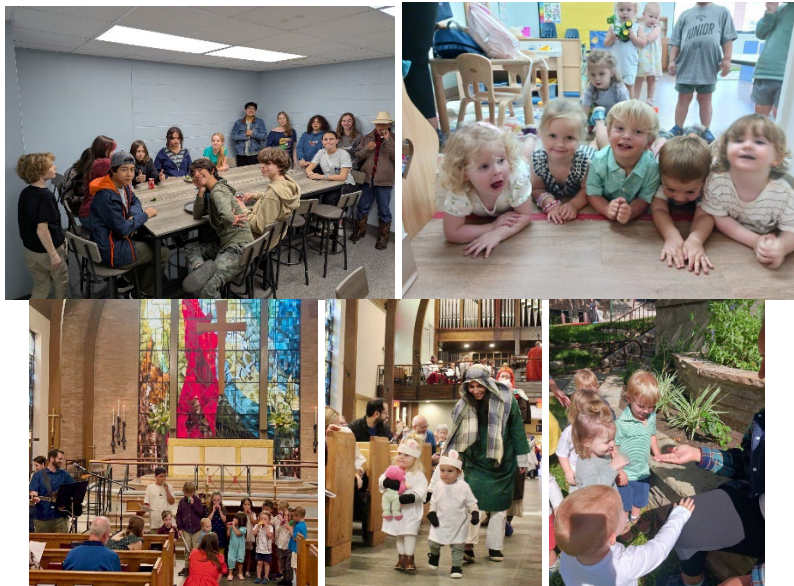
Children Ministries, 9am service (2025) – Christmas Pageant (2024) – Mustard Seed Butterfly Release (2025)