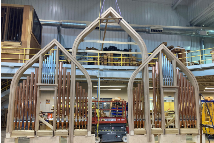
A portion of the organ in the Reuter warehouse.